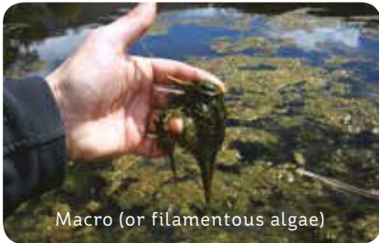
Macro (or filamentous algae)